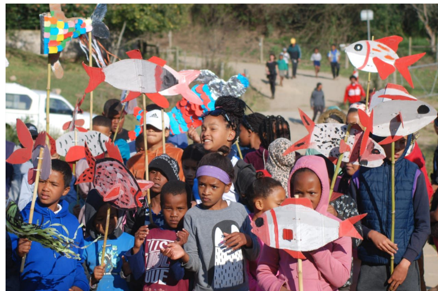
Caption: A few of our youth beneficiaries who participated in the June School Holiday Programme in Suurbraak.

Holiday Programme Inspires Awareness and Creativity