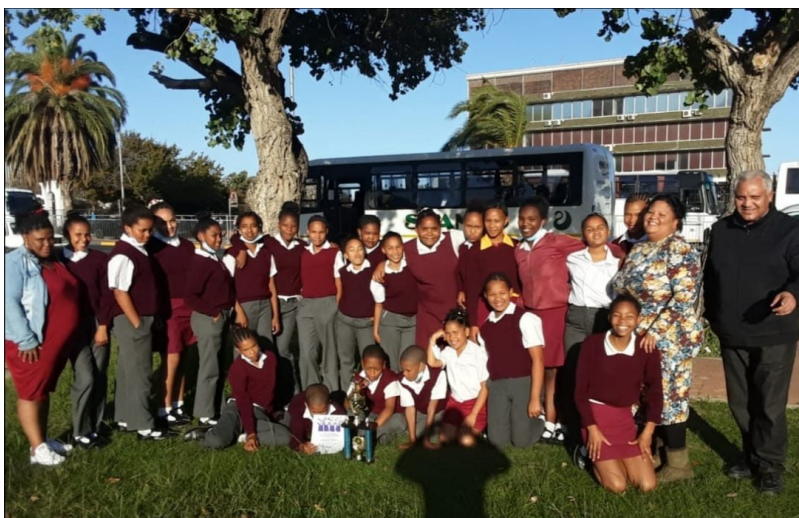
The school choir having secured a silver award, second place, at the Worcester Eisteddfod in May.

There is no stopping these young musicians now.