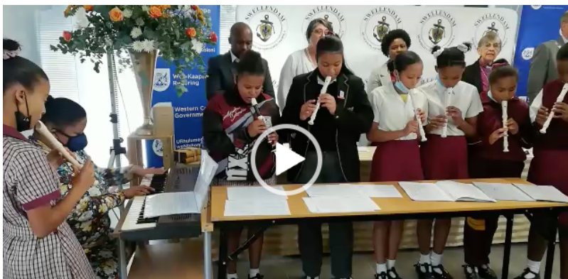
Our young musicians performed the South African National Anthem at the opening of the Desmond Tutu Library in Swellendam, and they wowed the crowd!