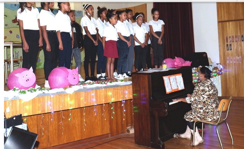
The choir also performed at the school cultural evening.

You can help us reach many more vulnerable youth by supporting our work today. Simply click on the link below!